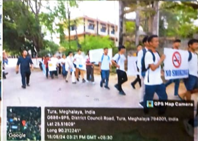
Tura, Meghalaya, India G686+9PS, District Council Road, Tura, Meghalaya 794001, India Lat 25.51609° Long 90.212241° 15/05/24 03:21 PM GMT +05:30

NSS ALONG WITH NCC, TURA GOVERNMENT COLLEGE, TURA ORGANISED A RALLY "WALK FOR TOBACCO FREE MEGHALAYA" AS A PART OF WORLD NO TOBACCO DAY 2024 FROM COLLEGE CAMPUS THROUGH COUNCIL HAWAKHANA ROAD, WILLIAM POINT AND BACK TO COLLEGE, HELD ON 15 th MAY 2024. ABOUT 40 NSS VOLUNTEERS AND 20 NCC CADETS ALONG WITH NSS PO'S AND NCC CTO'S AND COLLEGE NODAL OFFICER FOR TFFI TOOK PART IN THE PROGRAM.