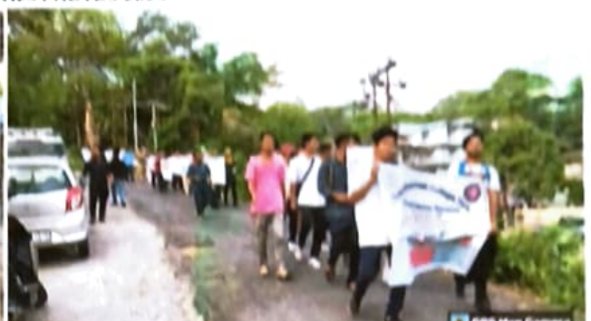
Tura, Meghalaya, India G686+9PS, District Council Road, Tura, Meghalaya 794001, India Lat 25.516181° Long 90.211942° 15/05/24 03:25 PM GMT +05:30