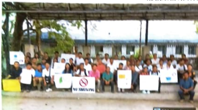
Tura, Meghalaya, India G686+9PS, District Council Road, Tura, Meghalaya 794001, India Lat 25.51638° Long 90.211864° 15/05/24 03:17 PM GMT +05:30